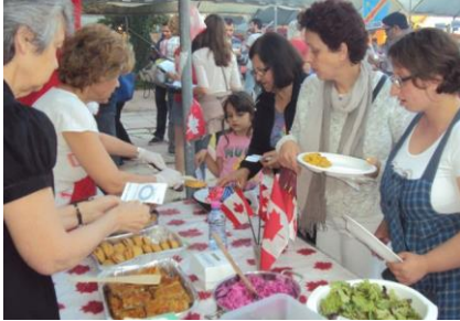
The Canadian table serving tourtiere and salad at Thessaloniki's ethnic Food-for-Good Festival last year