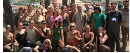
Kallithea group photo 2010

from the village, a daily climb with an elevation of 300 meters.