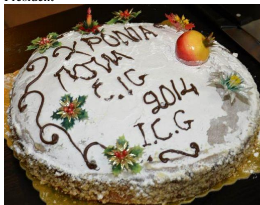
The Institute's Vasilopitta for 2014