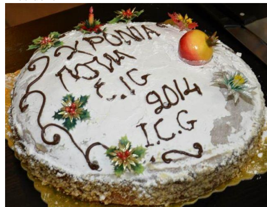
The Institute's Vasilopitta for 2014