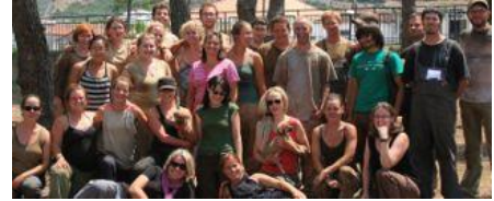
Kallithea group photo 2010

from the village, a daily climb with an elevation of 300 meters.