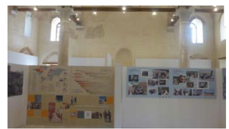
General view of the exhibition from the entrance to the mosque

The Ministry also organized a photographic exhibition to accompany the conference, and this opened on October 18 in the Fethiye Mosque in the Roman Agora of Athens. A number of the Institute's field projects contributed material for the exhibition which will be on display until November 28 and is well worth a visit. Warm thanks to our colleagues in the Ministry for organising these events