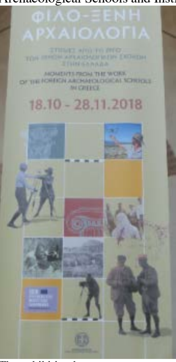
The exhibition banner

showcasing the work of the Foreign Archaeological Schools and Institutes.