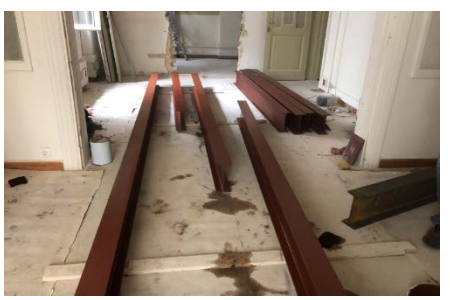
I-beams waiting to be lifted into place

Today the workmen were finishing up the job of putting in all the I-beams below the ceilings of the first floor (to support the second floor when it's being used as a