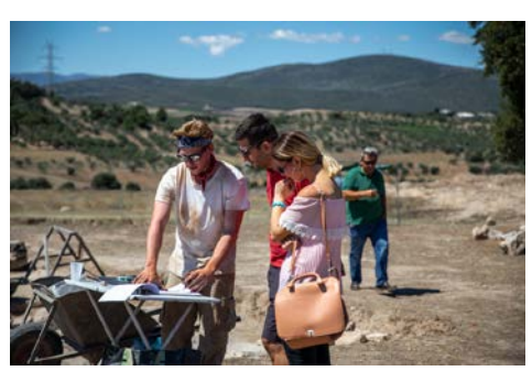
A student from the Eastern Boeotia Archaeological Project shows excavation findings to local people visiting the site.