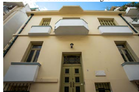
Exterior view of the Canadian Institute in Greece's new building in Athens

We produced a series of videos to support the Canadian Institute in Greece's (CIG) Million Dollar Campaign. Our goal was to bring to life what CIG does and why it's so important. We did this through two key stories: the story of CIG and its origins, and the story of one of the archeological excavation sites CIG supports, the Eastern Boeotia Archaeological Project in Eleon. Greece. We also created video tours of two of CIG's key sites: CIG's new building, which is the reason for the Million Dollar Campaign, and CIG's Accommodations for researchers and students visiting Greece.