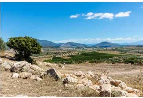
View of a landscape from the Eastern Boeotia Archaeological Project.