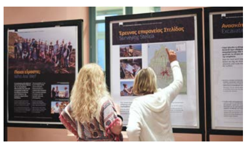
The Exhibition visitors engage with one of our posters (J. Lau); for full content see the <a href="http://www.stelida.org/">http://www.stelida.org/</a>