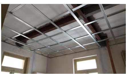
The framework for the false ceiling with the structural support (I-beams) above.

Detailed studies have been received for audio-visual, security and fire-detection, and these have been considered by the